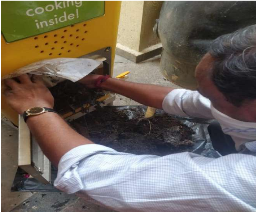
Collection Of Manure