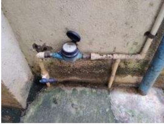
WATER FLOW PIPES