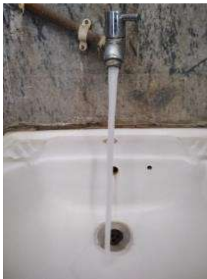
Aerators Taps For Washing