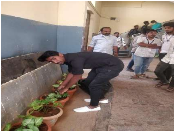
Manuring The Plants