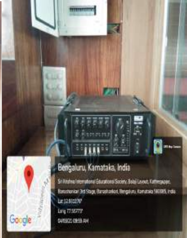
Digital sound system in auditorium